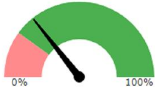
ICU Bed Availability (20% threshold)