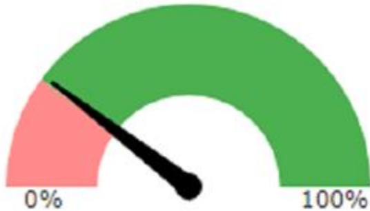
Med Surg Bed Availability (20% threshold)